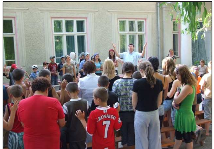
The mayor of Larga, Romania (a new convert) allowed us to share at a secular summer camp with 50 children accepting the Lord as their Savior.