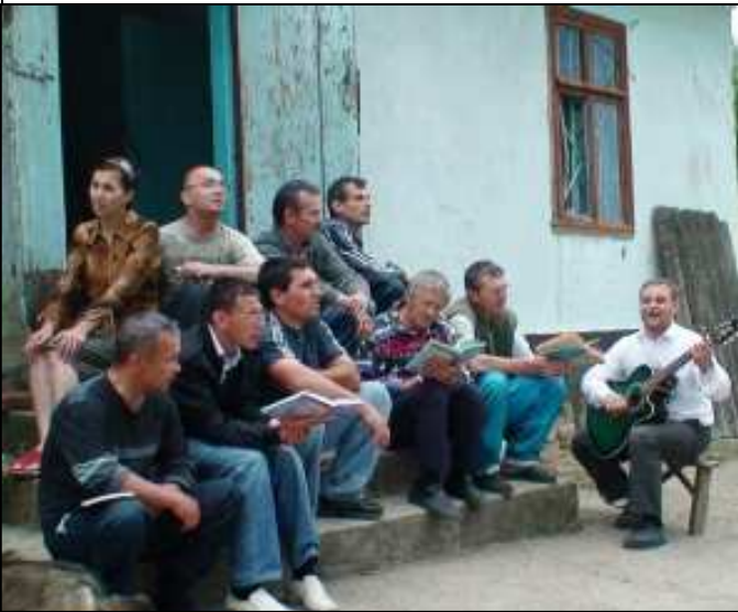
Here the men sing and praise the Lord at the rehabilitation center.

A recent radio advertisement on a Christian station in the U.S. is using an alarming statistic recently. They say that 74% of people in the U.S. have been impacted by alcohol or drug abuse. It is a worldwide problem. During a recent trip across Moldova we made an unscheduled stop at a new rehabilitation center opened by a GMI-sponsored national missionary. Four recent converts had become the first residents during the past month. To our surprise, the pastor whom God called to oversee this center had been forced to move in with his wife and children when their apartment was sold out from under them. They had spent 4 years in Sacramento, living a good life when God called them back. Now here they were, with 4 children between the ages of 2 and 7, living in a dilapidated house with no water and no electricity. Yet they were not complaining. When we made the unannounced visit we found them without food, a situation we immediately remedied. We praise God for interrupting our plans.